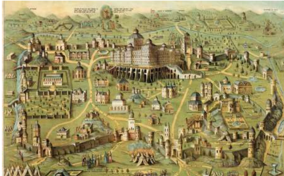
Image of Solomon's Temple from US Library of Congress. https://www.myjewishlearning.com/article/ancient-jewish-religion-and-culture/