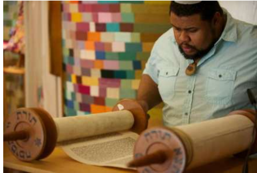
Photo of Michael Twitty.